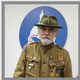
P-B NCAC Scout Historian Washington D.C. District Volunteer